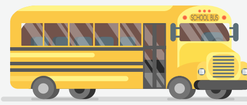
70 cubic yards = 5.5 school buses!

Approval as a Permit by Rule compost process led to 70 cubic yards of dirt and compost material being kept from the landfill